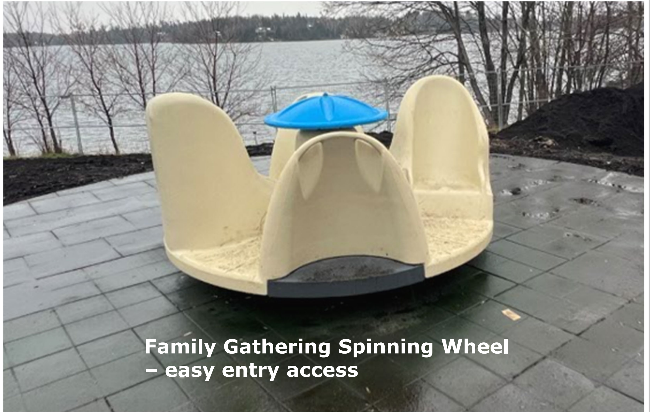
Family Gathering Spinning Wheel – easy entry access